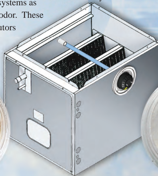
Hornet bathing a residential A/C coil with UV-C energy