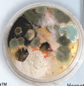
Typical A/C Coil Mold Growth Before the Hornet™

Now you can have this same technology at home or work! The Hornet™ employs a high efficiency, high-output "green" UV-C lamp that can last up to two years. Once installed, it destroys surface and air microbes that grow, migrate and circulate in HVAC systems as allergens, infectious agents and odor. These microbes can be serious contributors to poor health, bad IAQ and disease. The Hornet helps wipe them out!