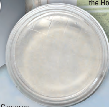
Typical A/C Coil Mold Growth After the Installation of the Hornet™

The Hornet can be hard-wired or its 24Volt adapter can be plugged into any standard 120V outlet. Simply, Hornet's state-of-the-art 24V power supply can efficiently deliver 22 Watts of Green UV-C power to most any application you have.